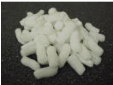
Figure 1: Loose-Fill-Packaging

“Biodegradable materials based on re-growing raw materials have been discussed, developed and promoted as a solution of many environmental problems for a long time. Nevertheless, a broad introduction to the market has not taken place yet. In the discussion, this is frequently attributed to a lack of clarity concerning the ecology-related evaluation. These uncertainties in turn have an effect on the customer’s behaviour, the product development, or the waste disposal. Until now, research results that allow a reliable assessment of the environmental benefit of such materials are hardly published” (Würdinger et al., 2002). The reason for this study was the question whether plastics based on re-growing raw materials should be promoted to a higher degree henceforth. Two loose-fill-packaging systems were selected exemplarily as the relevant survey objects: one of them is based on the re-growing raw material starch, the other on expanded polystyrene (EPS) which is produced from fossil raw materials.